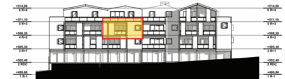
NIVEAU 1 - R+1